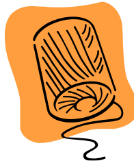
piece of string